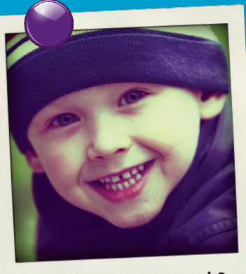
Healthy habits for life

Communicating with your child about a healthy weight